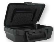
Protective carrying case