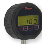
DPG-100 with protective rubber boot